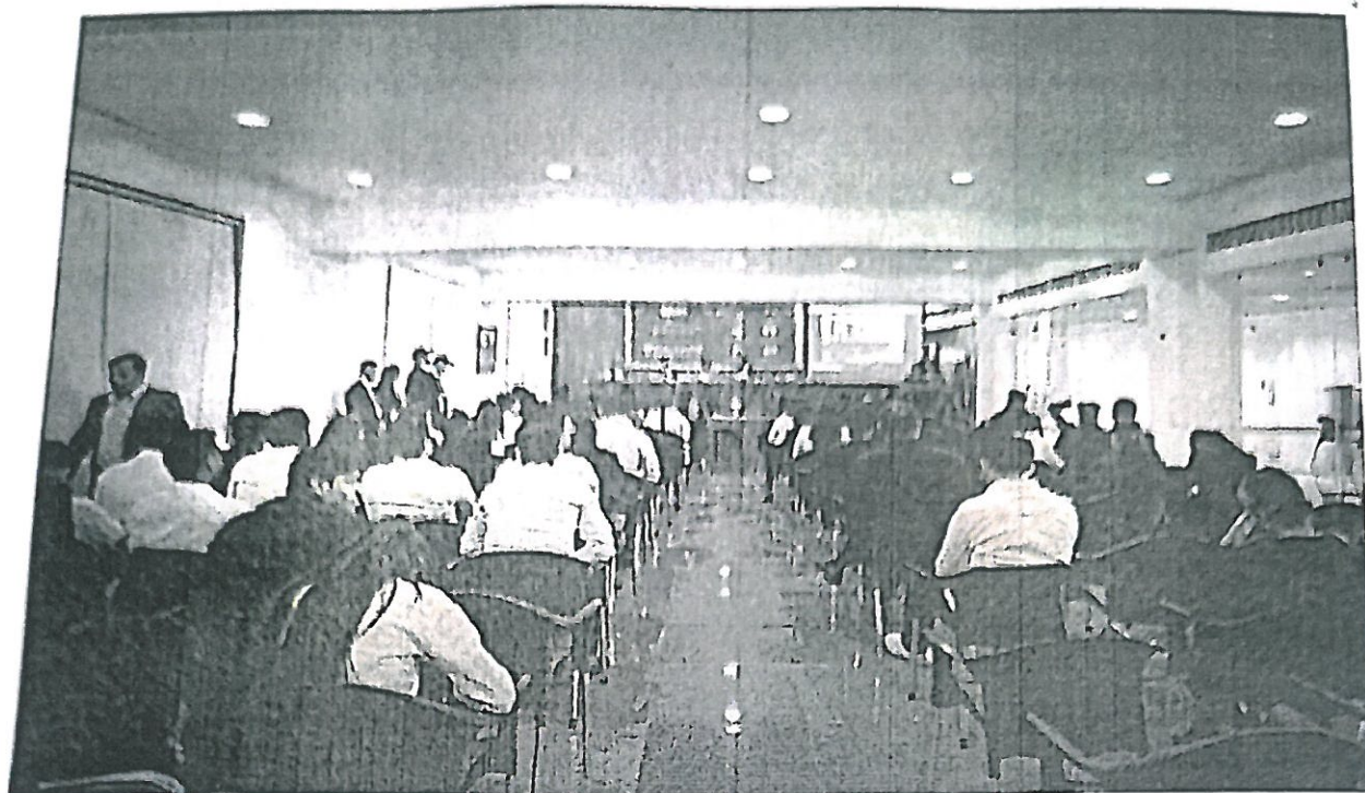
Photo: 2: Students and participants enthusiastically participated in the conference.