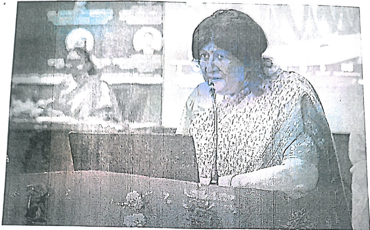
Photo1A: Hon'ble Ms. Justice Indira Banerjee, Retired Judge, Supreme Court of India during inaugural session sharing her words of wisdom with august gathering.