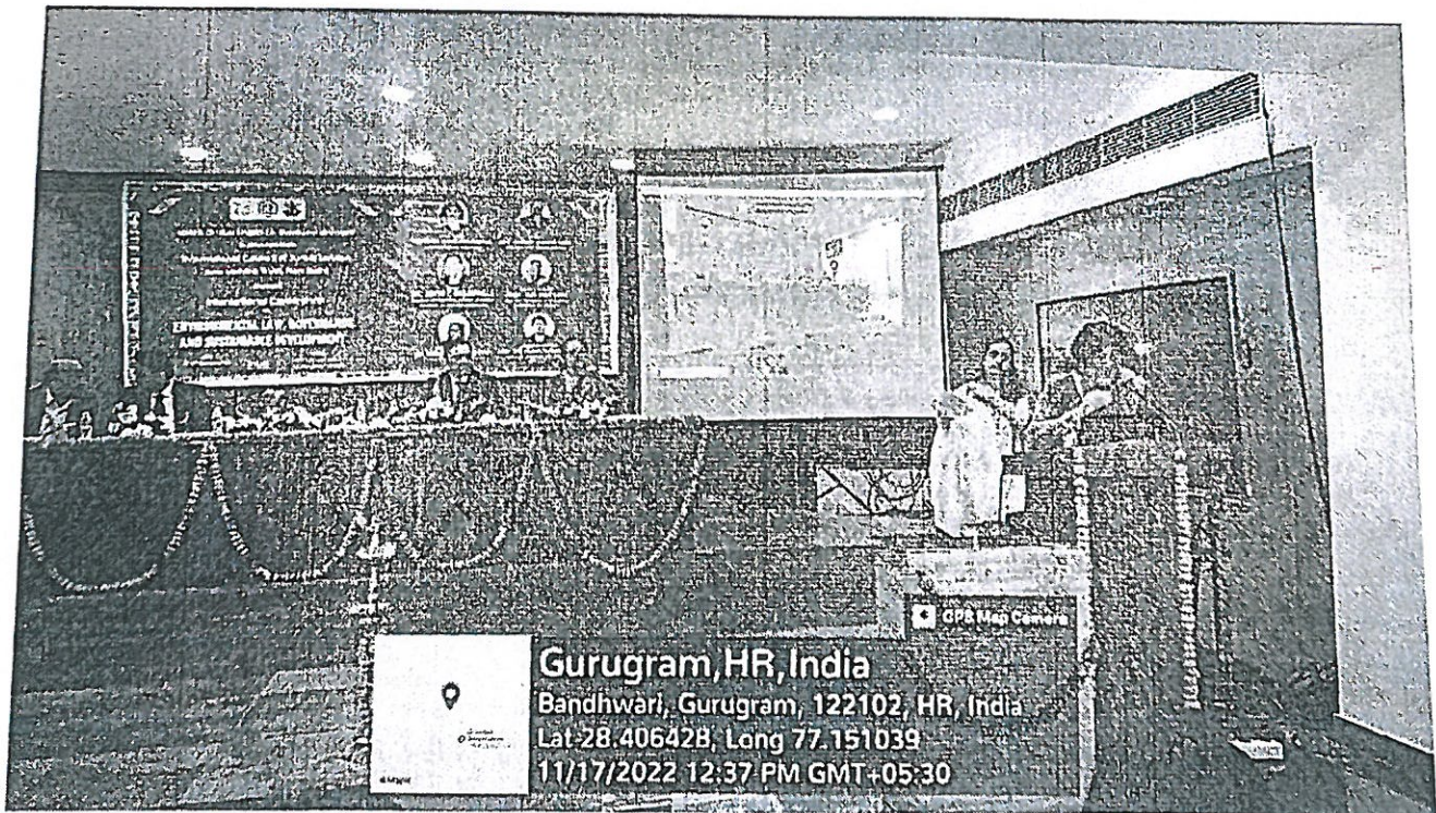
Photo1B: Hon'ble Ms. Justice Indira Banerjee, Retired Judge, Supreme Court of India during inaugural session sharing her words of wisdom with august gathering.